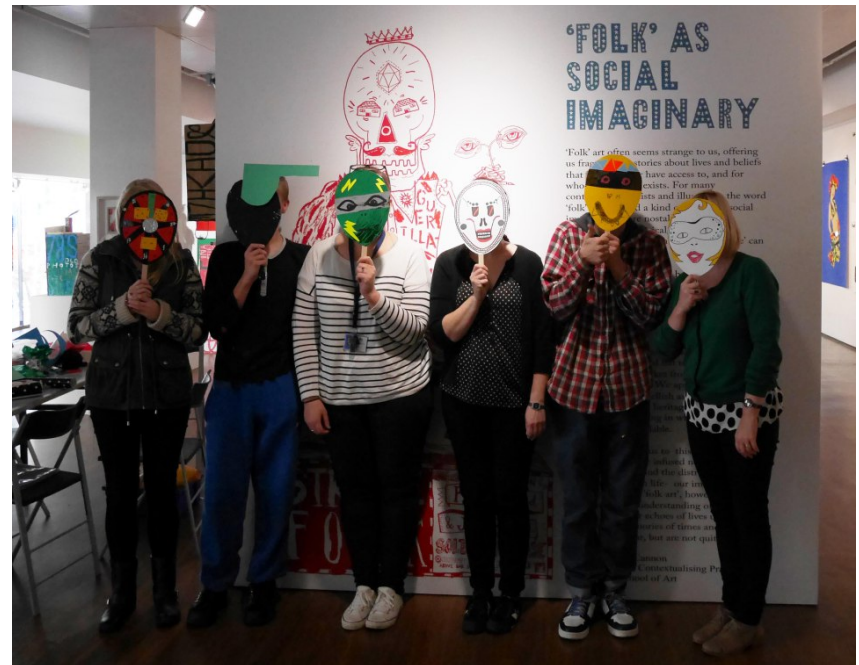
Young people on a visit to Solent Showcase